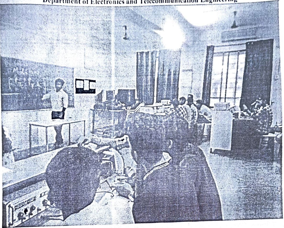
Hands on practice

Department of Electronics and Telecommunication Engineering